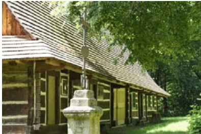
Vernacular timber architecture

At the beginning of July we started our summer tour through the south of Poland and spent ten extraordinary days inspecting towns, monasteries, palaces, gardens and traditional timber architecture. The biggest challenge was to make a choice – there is an awful lot to see!