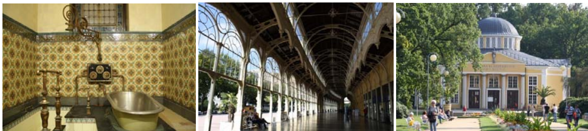
Between nostalgia and wellness: Karlovy Vary, Mariánské Lázně and Františkovy Lázně

My mother had joined me in the Czech Republic and for her birthdays we spent some nice days in the Bohemian Spa Triangle. In difference to my hometown Wiesbaden, which sadly stepped back from the serial World Heritage nomination " The Great Spas of Europe " this year, traditional spa business is still practiced at Karlovy Vary, Mariánské Lázně and Františkovy Lázně.