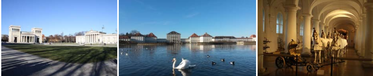
Culture temples at the Munich Kings' Square and Nymphenburg palace with the carriage museum

court". I especially enjoyed the final day at Nymphenburg park and palace with the newly designed carriage museum.