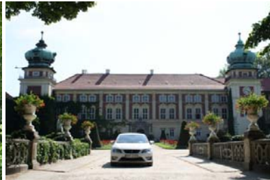
Impressive parks and palaces in Lancut and in Krasieczyn