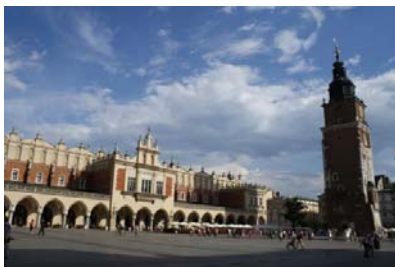
Krakow / Karakau