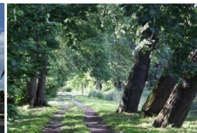
Hirschberg valley garden landscape